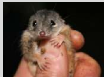
What this little cutie must be thinking

“and countless other animals would not be able to survive if fire practices did not support the habitats within the Mountains”.