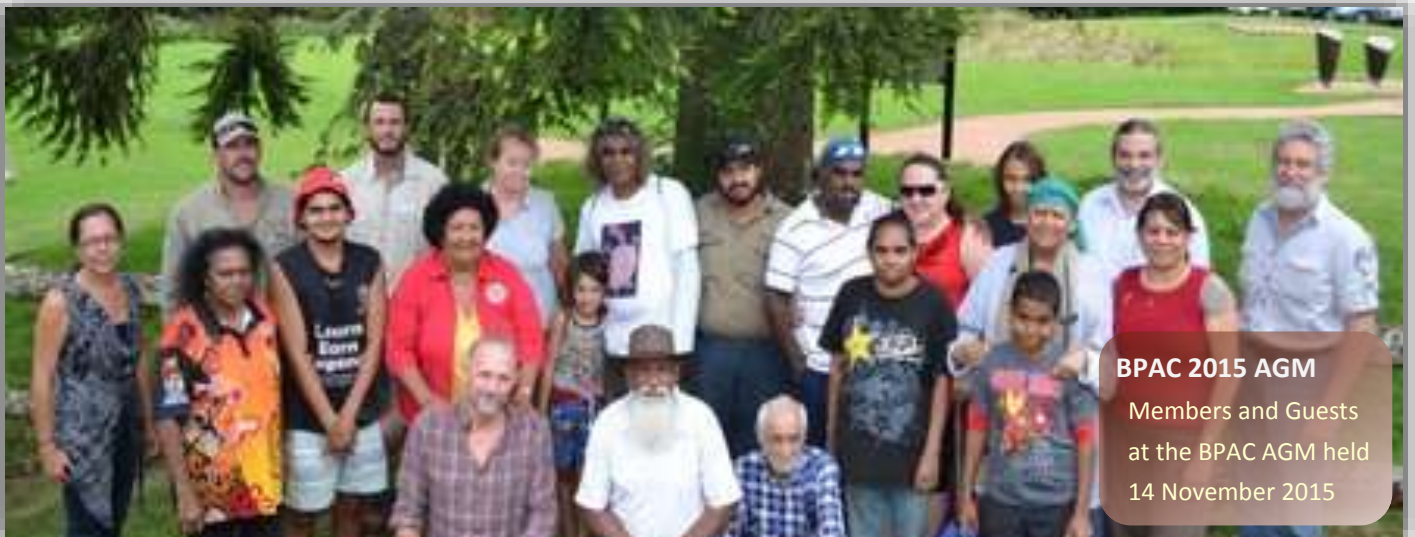
BPAC 2015 AGM Members and Guests at the BPAC AGM held 14 November 2015