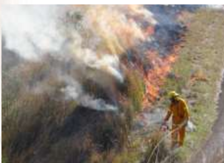
Photos: Firing up the Bunyas

The BPAC have been developing a partnership with the Queensland University of Technology to research the effectiveness of the Murri Ranger's management of the grassland balds.