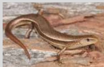
Lampropholis colossus (Bunya Sun-skink)

Some key animal species such as the black-breasted button-quail and the Bunya Sun-skink ( Lampropholis colossus ) depend on the grasslands and countless other species would not be able to survive if fire practices did not support the habitats within the Mountains. Not only are animals reliant on the grassland balds, but the ecological health of vegetation species surrounding the 'grassland balds' is important as well.